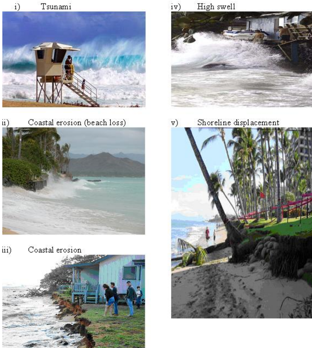
Figure 1: Common coastal hazards in Hawaii

location), with both upper and lower bounds at the 90% confidence level. For simplicity, only the plot for high sea level in Honolulu is presented (Fig. 3). The upper and lower bounds of sea-level extremes for all other stations are presented in Table 1.